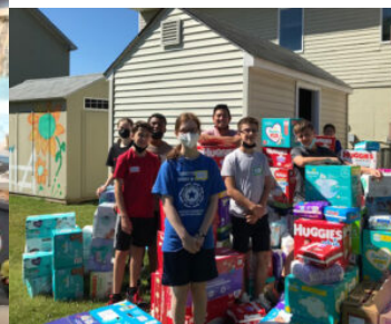
The Center for Great Expectations - Hope Lives Here 2022 Annual Gala