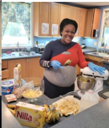
The Center for Great Expectations - Hope Lives Here 2022 Annual Gala