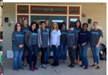
The Center for Great Expectations - Hope Lives Here 2022 Annual Gala