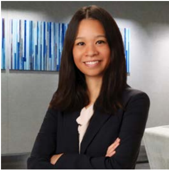
Robyn Lym Litigation