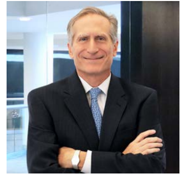
Jonathan S. Davis Real Estate