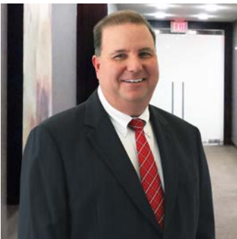
M. Sidney Donica Real Estate