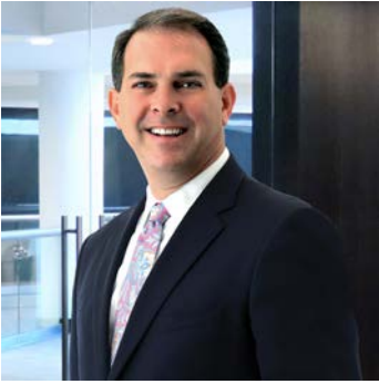
Allen J. Popowitz Real Estate