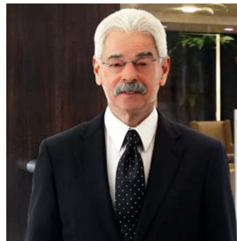
Alan R. Hammer Real Estate