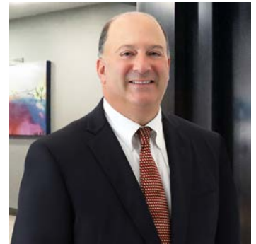
Richard B. Robins Healthcare Law