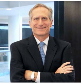
Jonathan S. Davis Real Estate