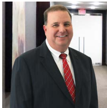
M. Sidney Donica Real Estate