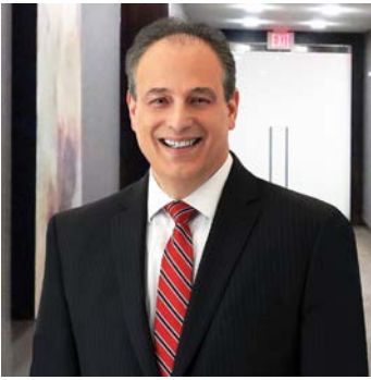
Carl J. Soranno Family Law Services